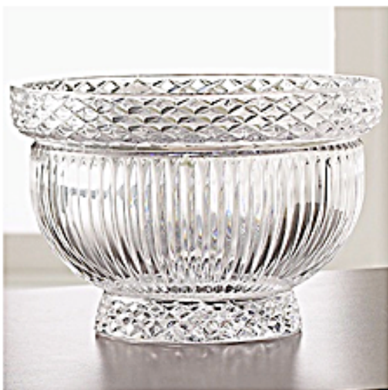
TROPHIES AND PRIZES