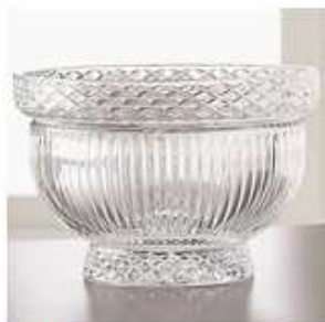
TROPHIES AND PRIZES